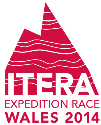
Main 'Contour' Logo Colour