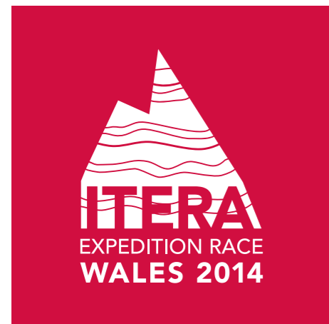
Boxed 'Contour' Logo Colour