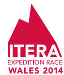
Minimum logo size 'without contours' 15mm wide

Only for use where logo needs to be replicated at less than 25mm wide