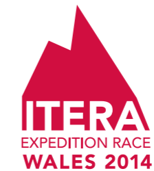
Maximum logo size 'without contours' 25mm wide