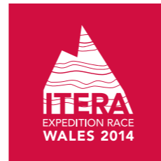
Minimum boxed logo size 'with contours' 30mm wide