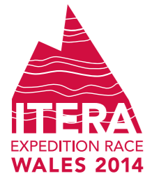
Minimum logo size 'with contours' 25mm wide