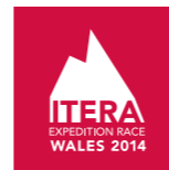
Minimum boxed logo size 'without contours' 20mm wide