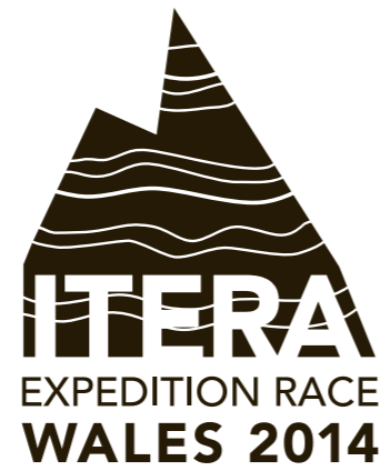
Main 'Contour' Logo Black